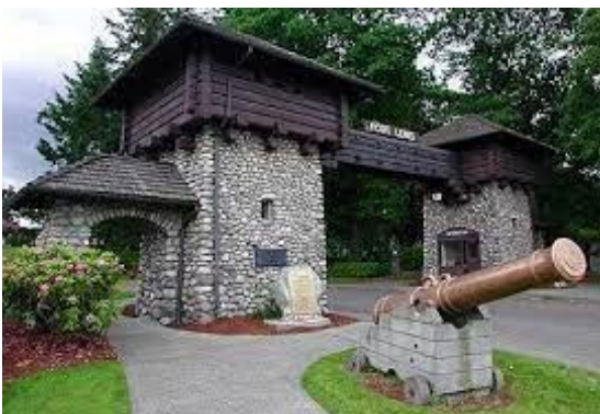
Beginnings of Camp Lewis...