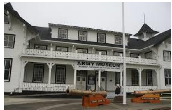
... And the Ft Lewis Museum