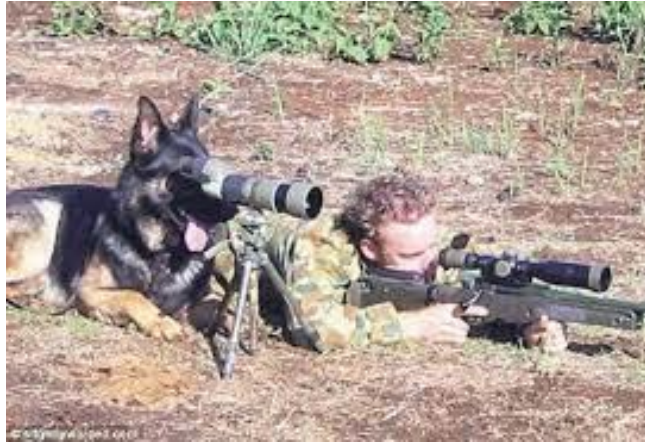
Humor in Uniform