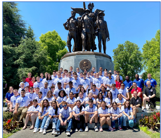
NWYLC Students June 26-30