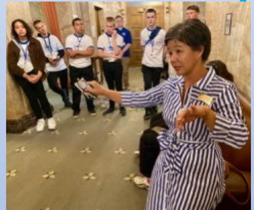
LJ did her magic and got students into the House and Senate in Olympia