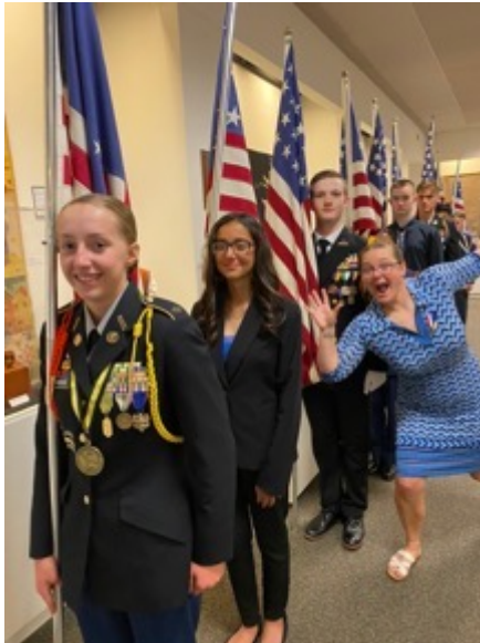
Patriotic Flag Program and MSG Earl Plumblee, Medal of Honor recipient, capped off the Northwest Youth Leadership Conference