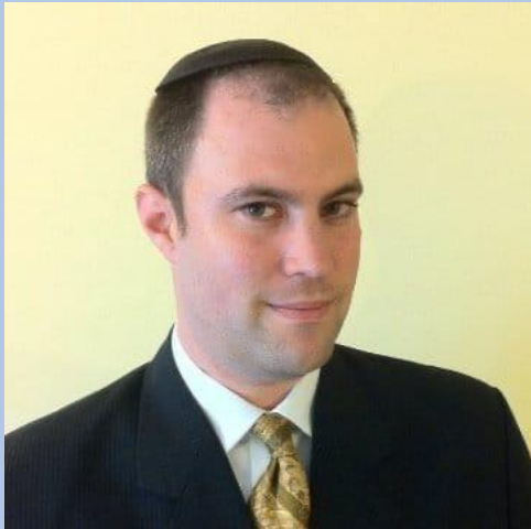
Israel/US National Security Impact