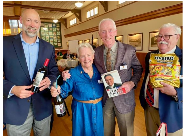
See What You win at the Puget Sound Chapter Monthly Meeting