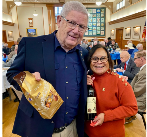
Winning at the Puget Sound Chapter November Meeting