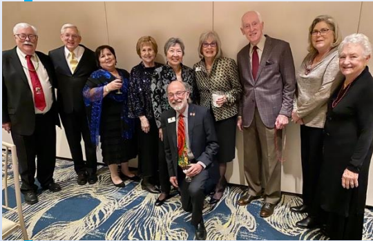
Some PSC companions pose for a picture before the dinner and dancing

Puget Sound folks participated in the Wreaths Across America effort at the Orting VA and Ft Lewis cemeteries