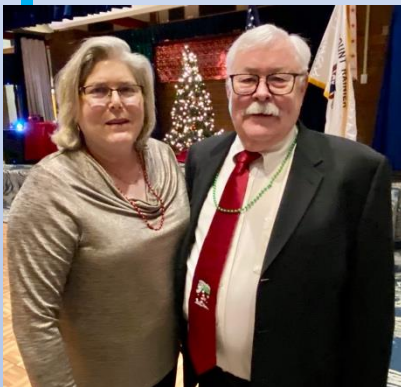
Looking good at the Gala with the Christmas tree in the background

Food, drink, and good cheer at the Steilacoom Tap Room on December the 14th