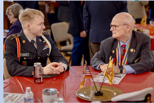
Companions visited with cadets as all enjoyed a delicious lunch prior to the patriotic program presentation