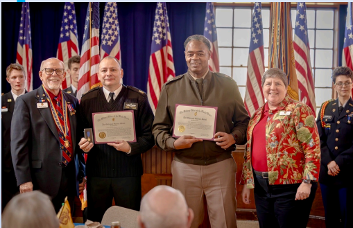
Peninsula and Steilacoom high schools brought their JROTC teams to provide an excellent patriotic program at the Steilacoom town hall on Sunday the 12th