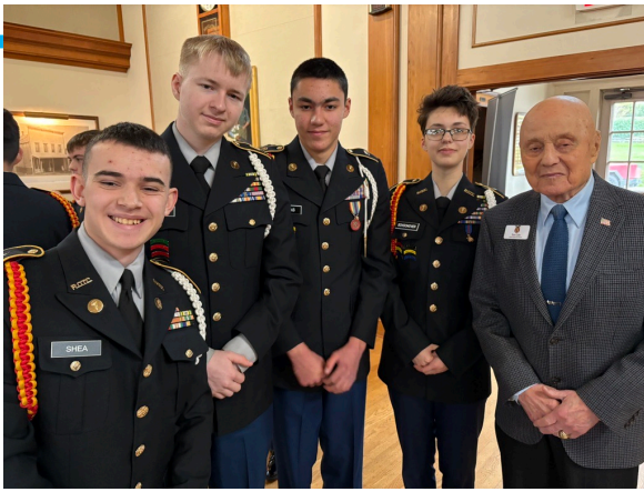
AJROTC cadets confer with General Cole