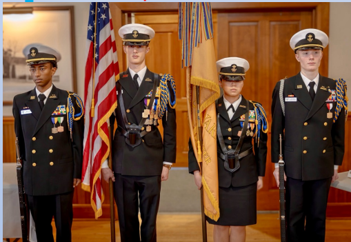
The NJROTC color guard presented the US and MOWW flags with precision