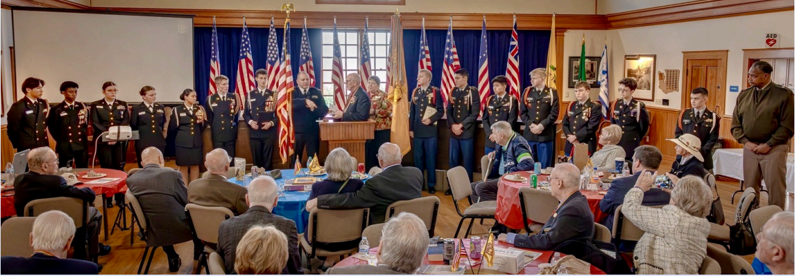
Navy (L) and Army (R) cadets brief the Puget Sound Chapter companions on Jan.12