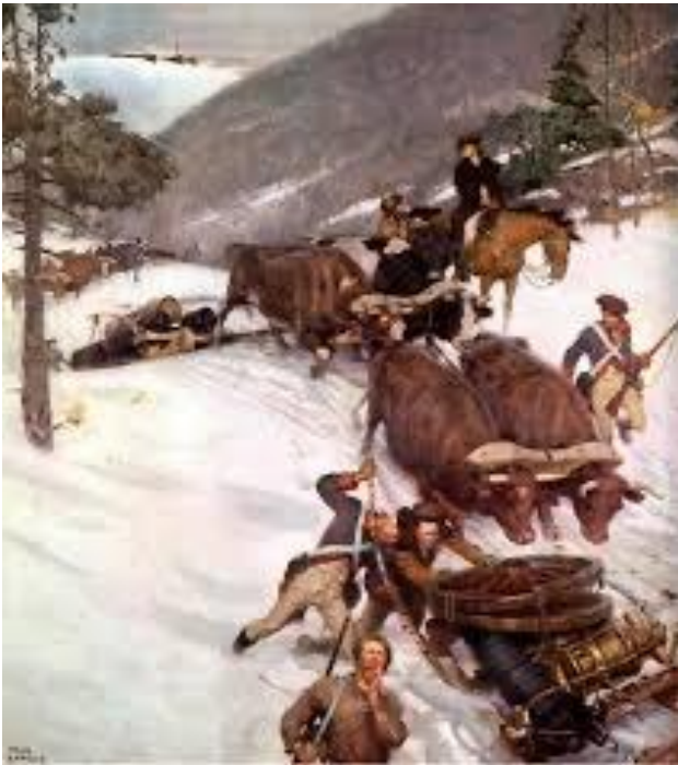
Oxen pulling canons in the snow