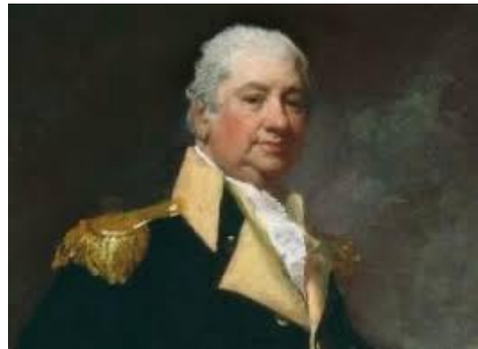
COL Henry Knox

On December 3 rd , John Paul Jones raised the 13-stripe Grand Union Flag over the Alfred marking the first time an American flag was flown over an American warship.